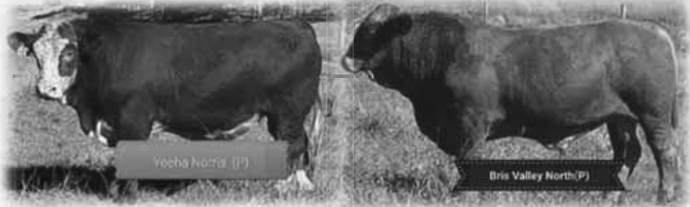
Yeeha North (P)