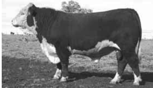
Th. H Mennie M242 (Lot 179)

2 Bulls for Casino 42nd Annual On-property Bull Sale – TOTAL 43 Bulls