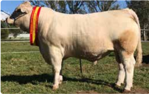
CALOONA PARK LEROY (ET) (P/S) LSFL40E (S)