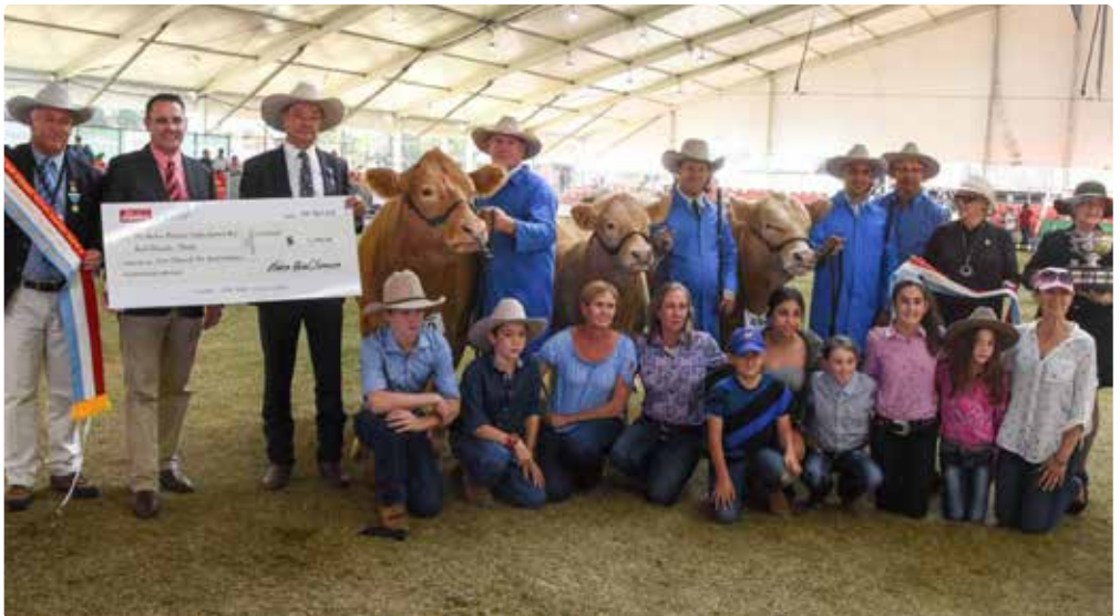
2019 SYDNEY ROYAL - THE HORDERN PERPETUAL TROPHY