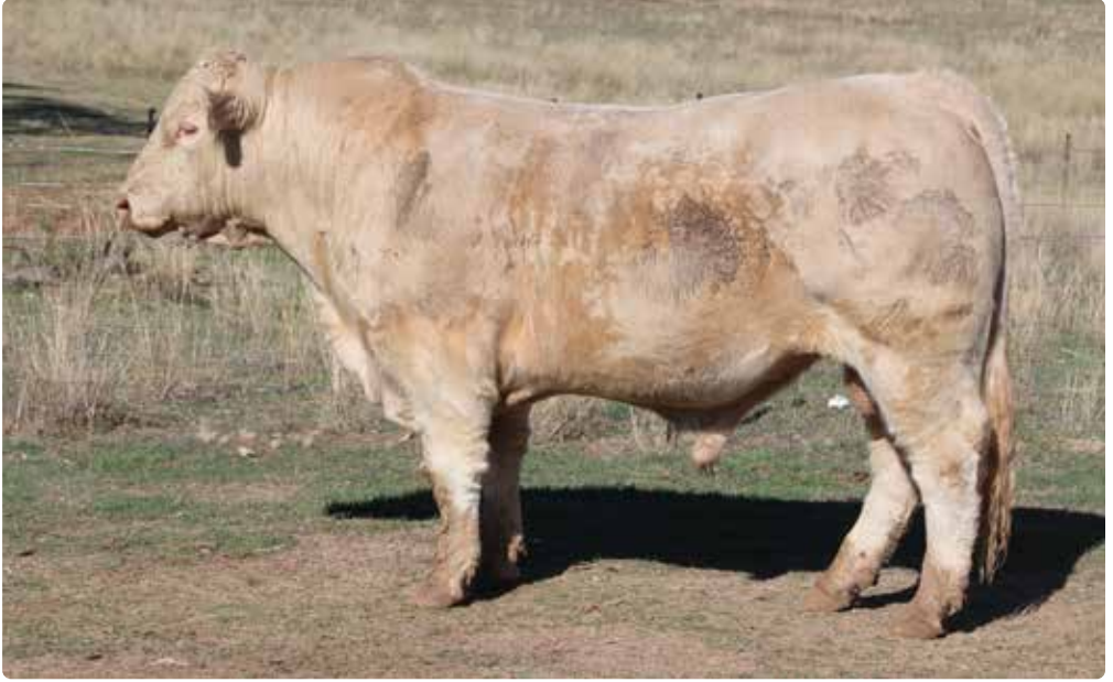
CALOONA PARK KODIAK (P) LSK123E (P)