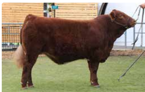
2019 SYDNEY ROYAL 1 ST PLACE HEAVYWEIGHT & SILVER MEDALIST