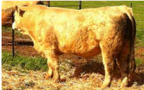
AIRLIE KIT K127E (AI) (P) A1SK127E (P)