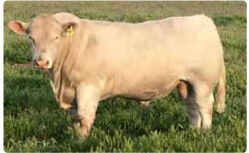
TEMANA K66E (P) TJK66E (P)