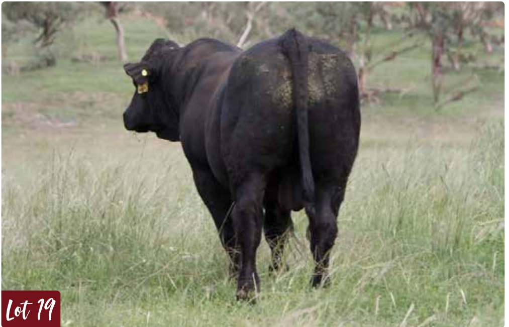
CALOONA PARK PROUD (P) (R/F)