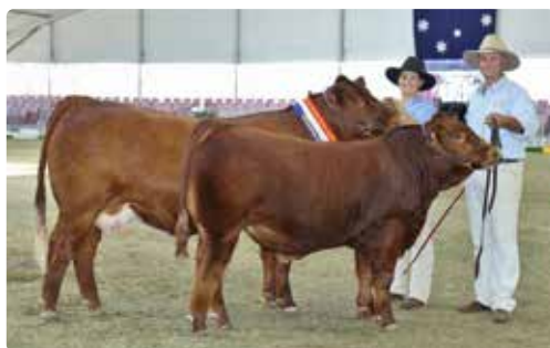
MD ROSANNE H565 & MD AMIGO K649