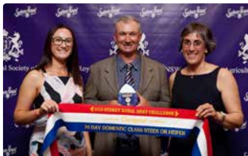
2019 RAS BEEF CHALLENGE