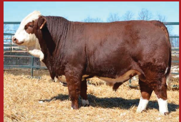
BAR 5 SA Hextor