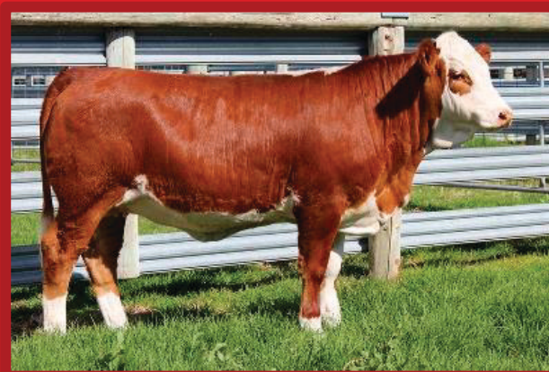
WOONALLEE REGAL K13