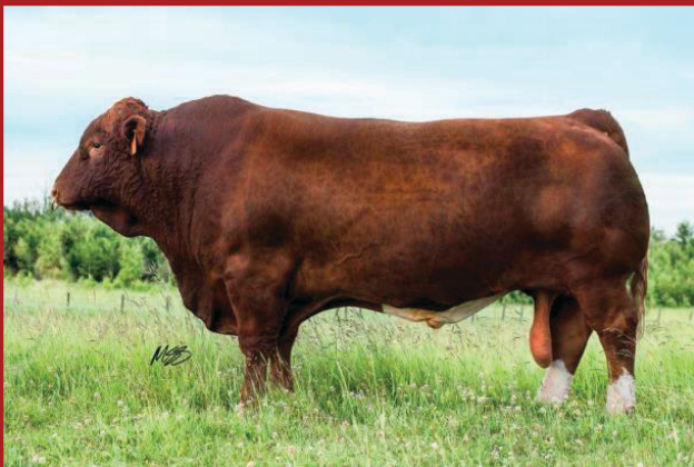
Double Bar D Spitfire