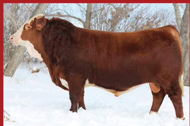
Starwest Pol Blueprint