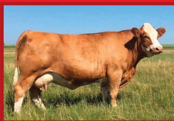
JB CDN FASHIONISTA