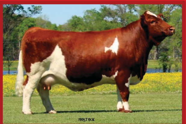
DIAMOND T MONA LISA 273U