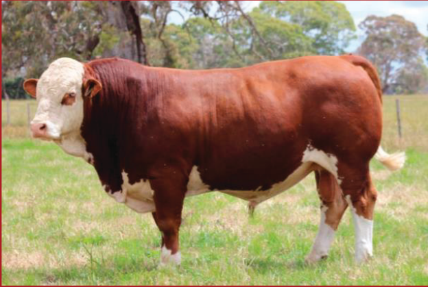
Grangeburn Masters Pride