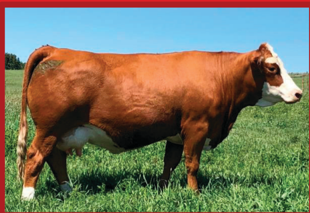
JB CDN ANTEBELLUM