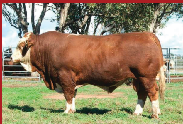
Billa Park Poll Churchill