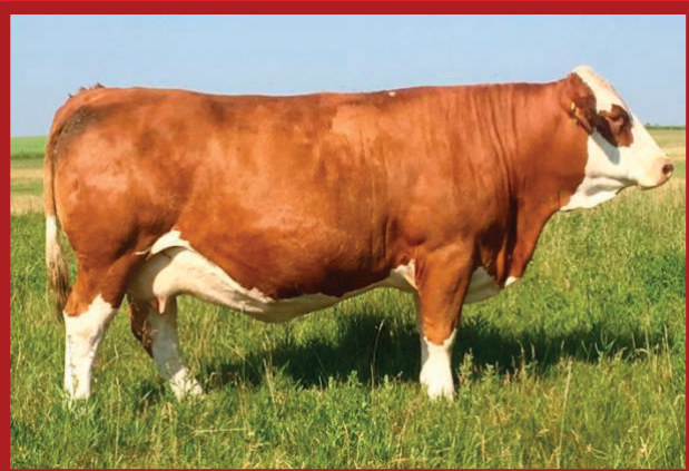
JB CDN ANNIFRIED