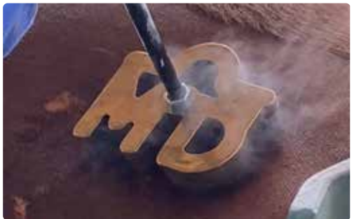
MALA-DAKI FREEZE BRANDING