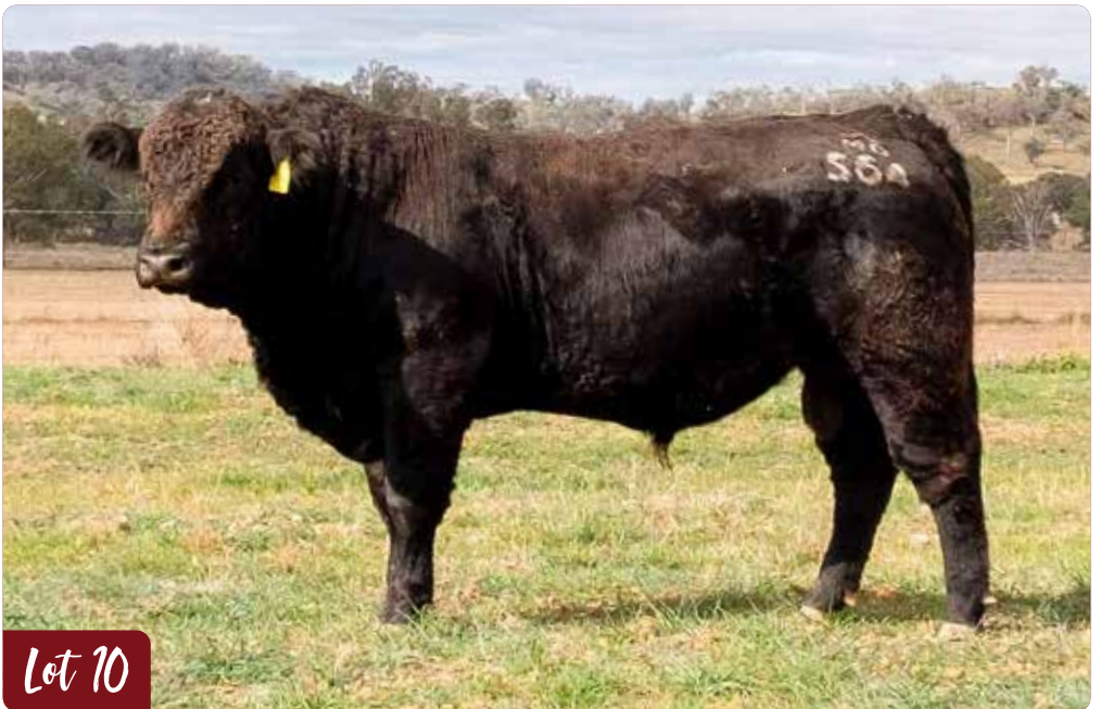
LUCKY CLOVER BLACK GUNNER