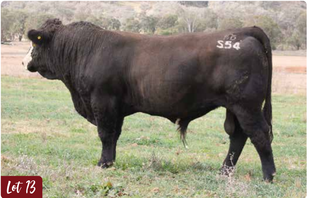
MALA-DAKI SHOCK N AWE S54 (P) (BB)