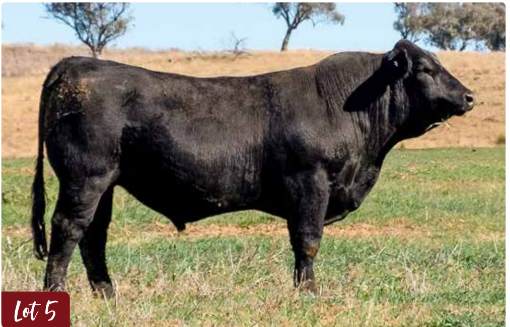
MALA-DAKI DAKOTA S60