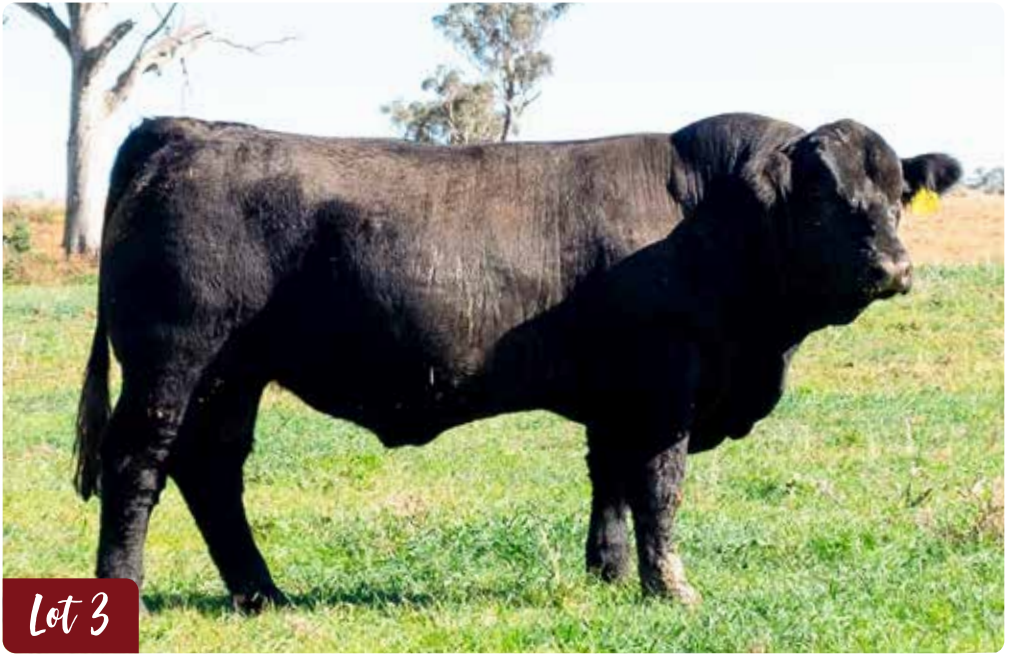
MALA-DAKI SHOCK N AWE S41 (PP) (BB)