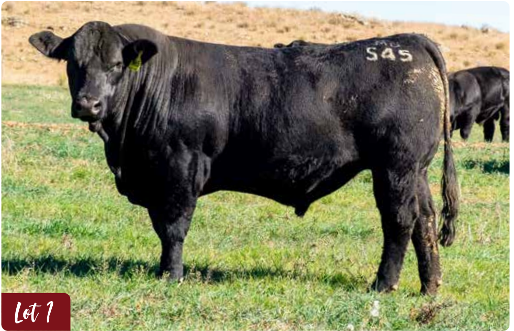
MALA-DAKI SHOCK N AWE S45