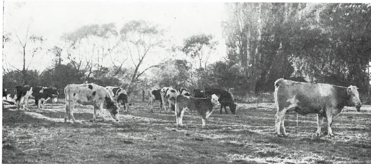
Willingale Atheni with Pride calf at foot alongside transplanted recipients immediately after operation.