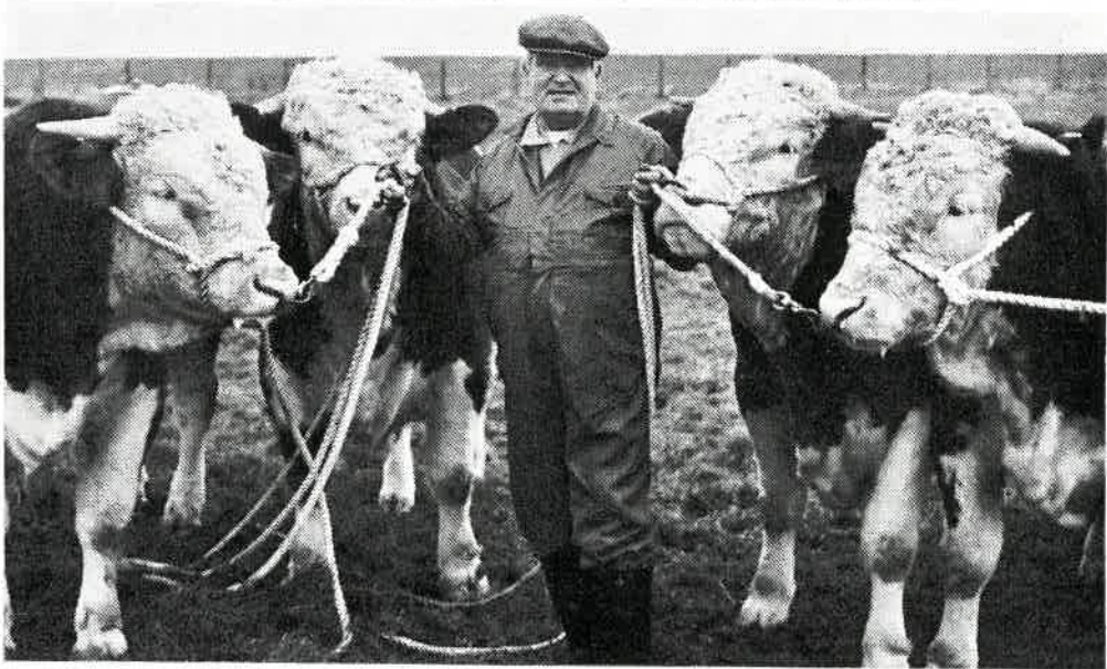
Four young Simmentals in the S.S.S. stud (left to right) — Scottish Command; Scottish Gerald; Scottish Patron; Scottish Hellas.

The Australian Simmental Newsletter — August, 1974