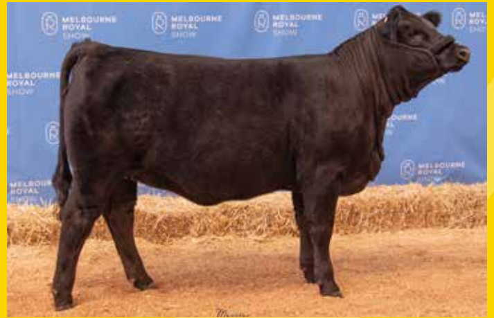
St Pauls Melbourne Show heifers in 2022. Related heifers sell Lots 27, 29, 30, 39 and 43.