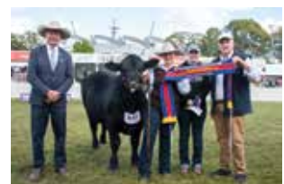
BULL CALF CHAMPION SILVERSMITH

CHECK FOR PROGENY LOTS 30 AND 43, GRAND PROGENY LOT 29 AND EMBRYOS LOT 50 AND 51.