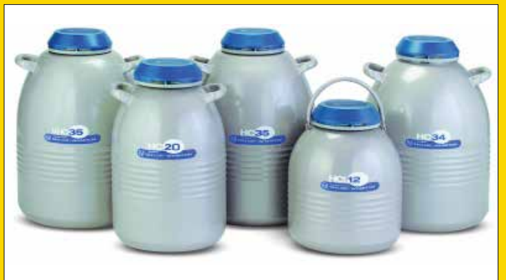
Check out Embryo Lots 48-53; Semen Lots 54-58; plus Semen given in Lots 35 to 47.