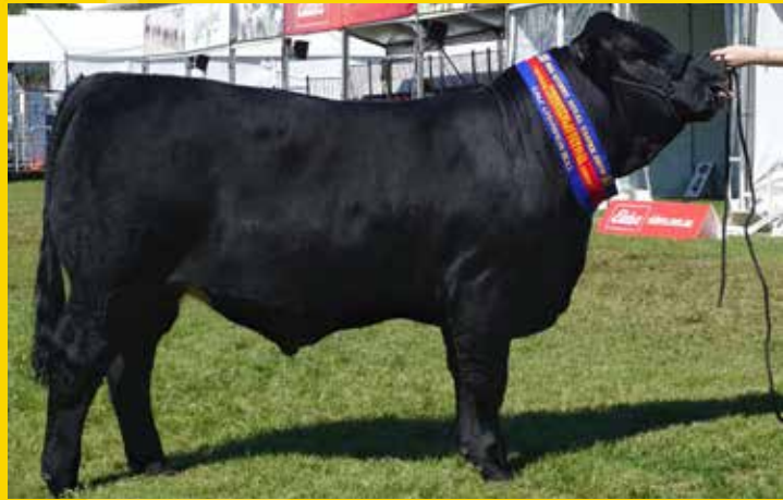
Bull calf champion Simmental 50 Years Feature Sydney 2022. Full sister to Lot 39.