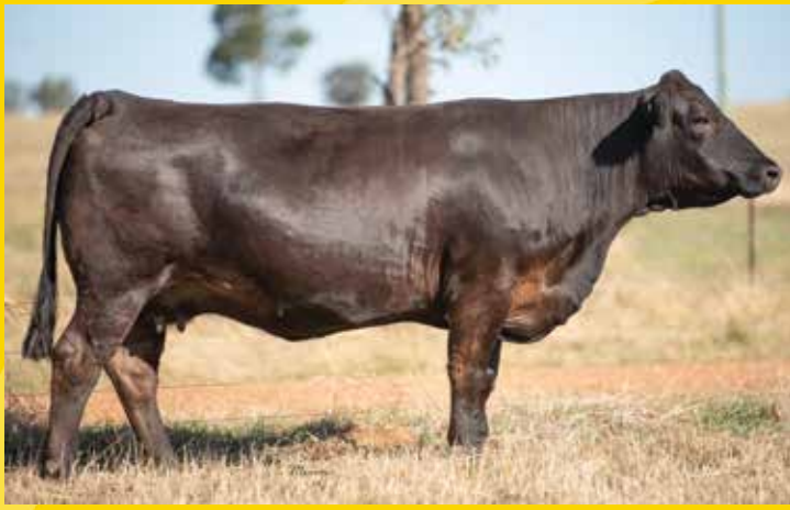
P401, donor dam of embryo Lot 49.