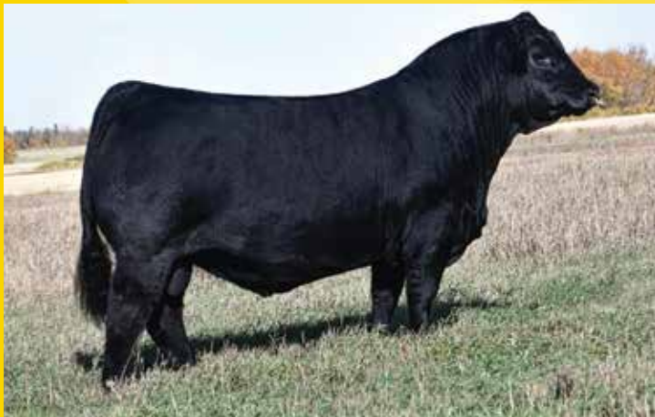
Unique opportunity to get Caliber genetics. 2 embryo lots, 4 females have calves at foot.