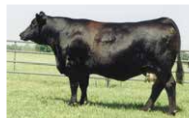
PRICKLY PEAR 615F