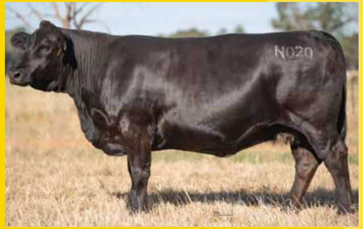
N020, donor dam of embryo Lot 52.