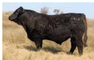
SECRET SQUIRRELL S412