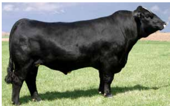
LOT 57 CIRCLE T ANTOINETTES STAR

Comments: Homo Black Homo Polled. New Release to Australia top 1% Growth, top 3% marbling.