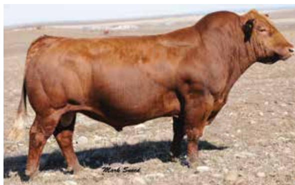
LOT 56 RFS RED IRON T20