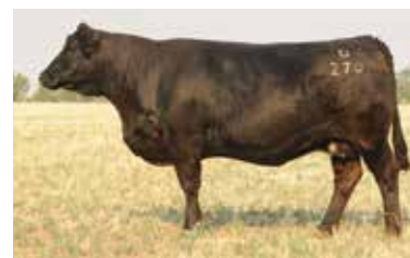
ST PAULS PEAR D270

At the Elite Sale, as invited guest, Silversmith sold for $22,000. Serbia being M412 natural calf sold for $20,000 and Secret Squirrel at $18,000. Two younger M412 sons, Story Teller and Ship sold as a pair for $25,000, privately as yearlings at St Pauls. $85,000 in total.