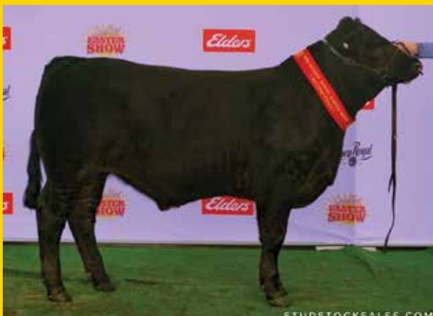
St Pauls Doug, Sydney Feature Show, 2nd on Hoof, 1st on Hook Class, 1st Taste Test, Silver Medal.