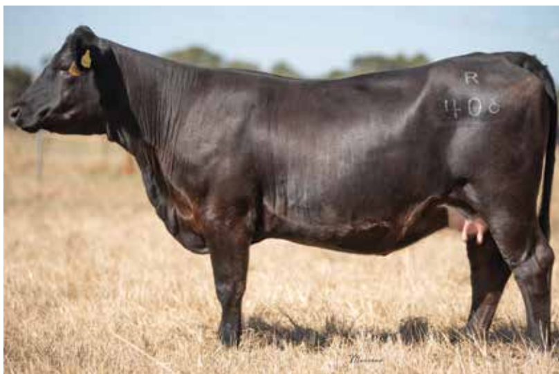
Photo of Dam R406

CCR COWBOY CUT 5048Z Sire: ST PAULS QATAR Q410 ST PAULS OLIE LUCY E433 CCR COWBOY CUT 5048Z Dam: ST PAULS CC K435 LUCY R406 ST PAULS TANKER'S LUCY K435