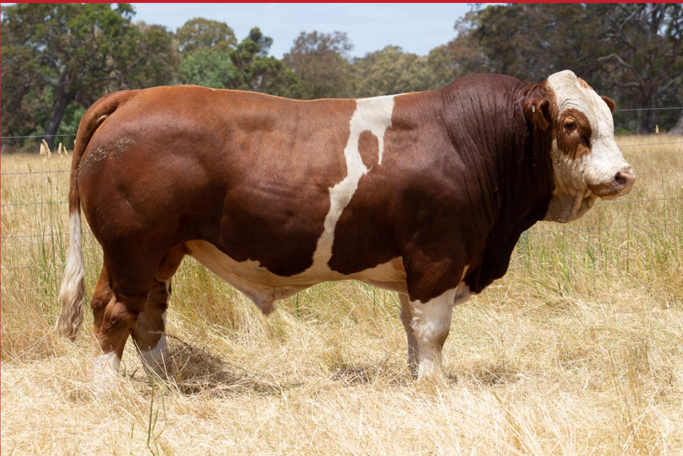
ZEUV030: HETERO POLL - DARK RED - BORN 11/03/2024

Very correct traditional to begin the offering with extra length and class. A dark horse all along whilst this group grew out, he's turned into a bull with extra length and great structure. Top 1% CW, Top 2% for both indexes.