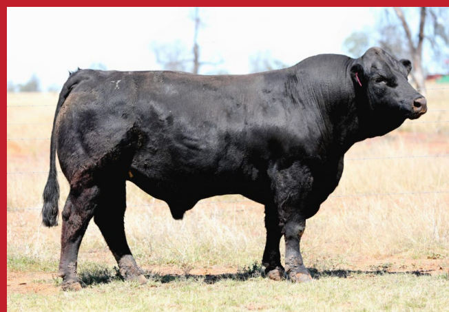
Yerwal Estate Q300