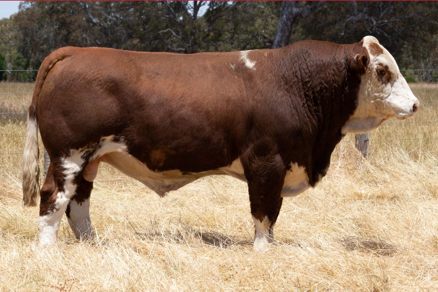
ZEUV008: HOMO POLL - DARK RED - BORN 23/02/2024

WILLANDRA MARMADUKE WOONALLEE SECRET SERVICE WOONALLEE DAISY L19