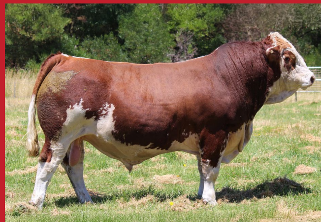
Woonallee Secret Service