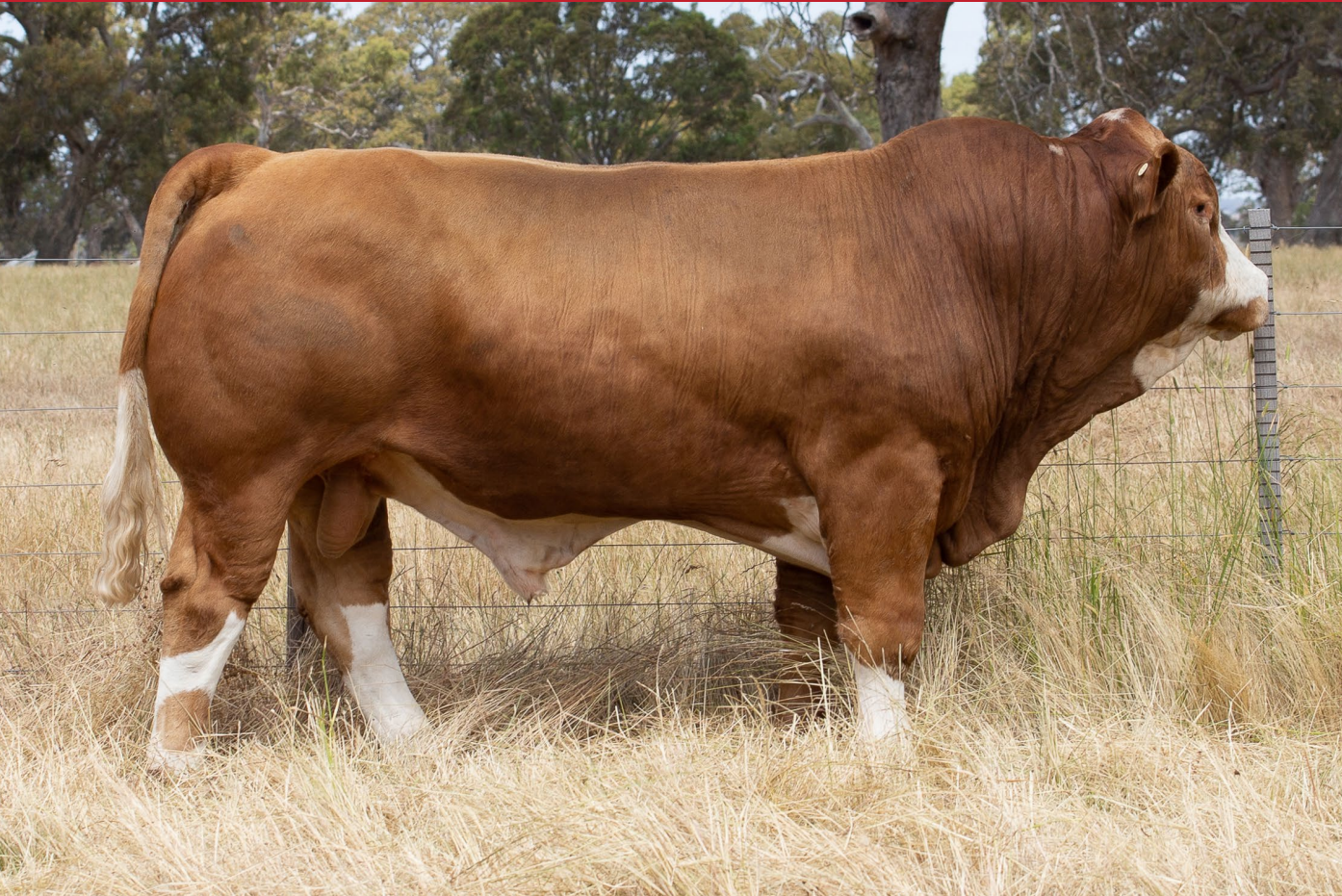
ZEUV046: HOMO POLL - DARK RED - BORN 18/03/2024

First of the Secret Service sons from a first calving heifer. He will add extra length. Very mobile bull with built in dehorners as he is homozygous polled. His dam is an outcross female with Canadian background, she has a perfect udder and is rearing another belter of a bull calf this year. Top 3% for CE, Milk and Marbling.