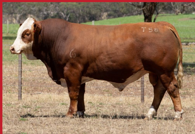
Grangeburn Terra Rossa