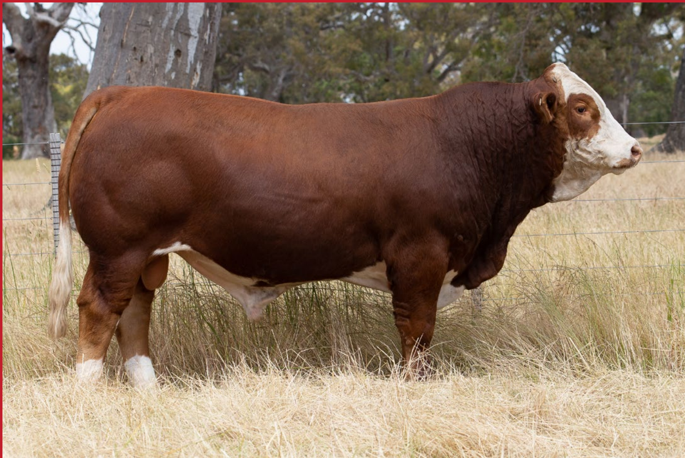
ZEUV037: HETERO POLL - DARK RED - BORN 14/03/2024

WORMBETE PARLIAMENTARIAN WORMBETE SAMPSON WORMBETE BELLE J102